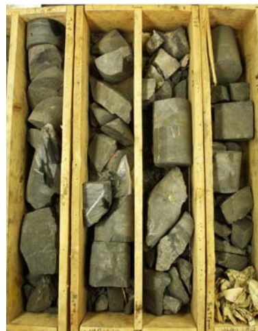
Figure 2. Gray fine-grained sandstone and siltstone of the Montney Formation. Note the lack of distinguishing features.

The Montney Formation is a Triassic sequence of very-fine-grained sandstone and siltstone in northeast British Columbia and western Alberta. Gas is hosted in the lower permeability (tight), finer-grained members of the formation (see Figure 2).