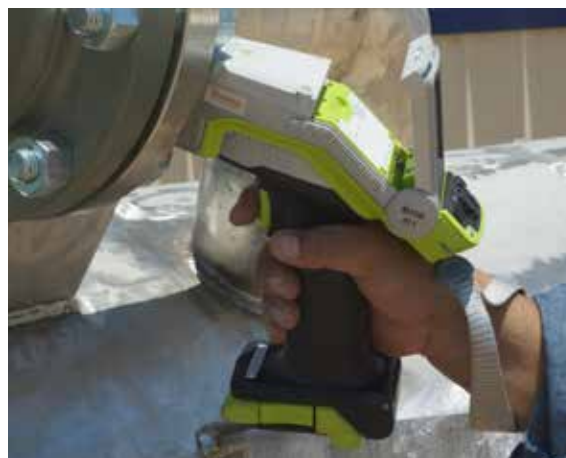
The Thermo Scientific Niton XL5 in use, analyzing finished welds in steel piping.