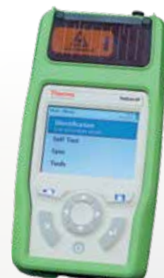
TruScan™ GP Raman Analyzer