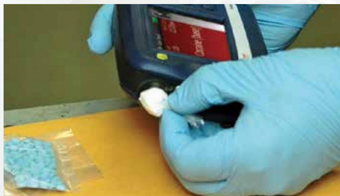
Field-based presumptive narcotics, precursor and cutting agent testing with a Trunarc.

A single test for multiple controlled substances provides enforcement officials with clear, definitive results for presumptive identification. Lightweight and easy to use, the TruNarc analyzer delivers fast and accurate narcotics analysis anywhere it's needed.