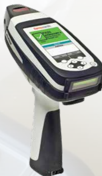
microPHAZIR™ RX NIR Analyzer

Custom organizations are also utilizing this instrument to verify different types of medications that are in passengers' luggage. They verify each medicine is in fact what the traveler claims the medication is. This ensures that medicines which should only be used with a doctor's prescription don't find their way into the consumer supply chain.