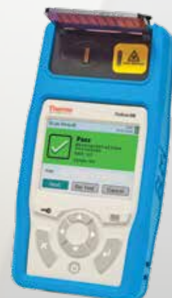
TruScan™ RM Handheld Raman Analyzer