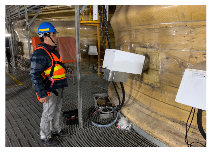
Use of continuous monitoring system for mercury emissions in a coal-fired thermal power plant

The EPA issued its latest guidelines – the Public and Private Places Fixed Pollution Source Fuel Co-firing Proportion and Composition Standards – in March 2020. The new update, an amendment to Article 28, item 2 of the Air Pollution Control Law, comprises clear specifications for fuel source management including composition standards for raw coal, fuel oil, petroleum coke and primary solid biomass fuel, as well as restrictions on the proportion of mixed combustion of waste fuels.