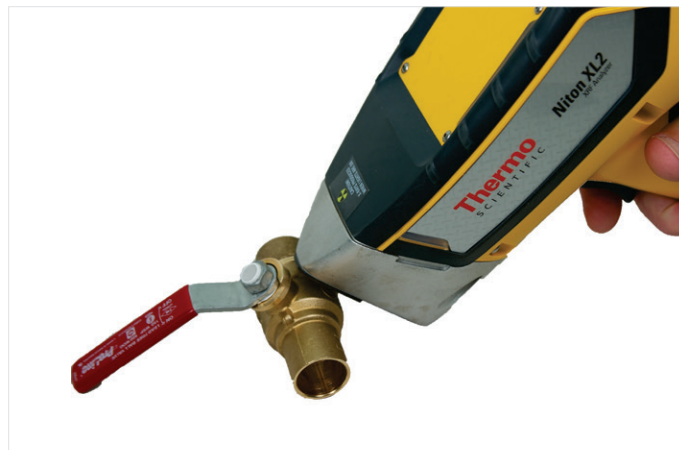
Figure 1. Point and shoot analysis of a valve body.