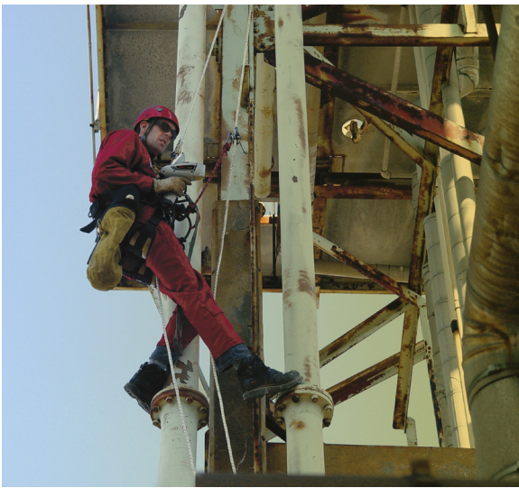
The Niton XL3t GOLDD+ PMI.

(P), and sulfur (S), and elemental accuracy can range as high as +/- 20 percent relative. Further, the electrode and the pistol head must be cleaned regularly to ensure accurate analysis and to prevent cross-contamination between materials. Burns from these tests create surface blemishes of a few millimeters in diameter and also can have considerable depth (approximately 1 mm).