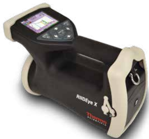
Thermo Scientific RIIDEye X Handheld Radiation Isotope Identifier

Find out more at thermofisher.com/riideyeX