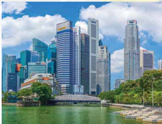
Singapore, known by many names including the 'Lion City'.

"With radioactive isotopes, the types of radionuclides and their quantity or concentration become the issue that requires detection."