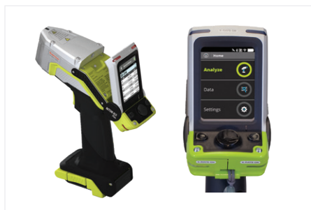
The Niton XL5 Plus Handheld XRF Analyzer.

Zr- and Ti-based conversion coatings improve paint adhesion and enhance corrosion protection of automotive bodies made of aluminum.