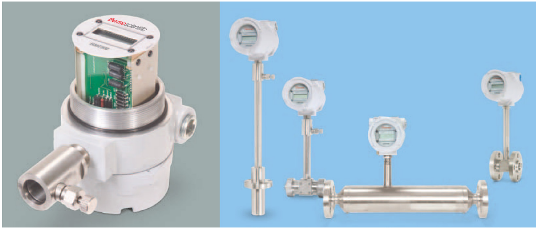
Thermo Scientific™ HME900