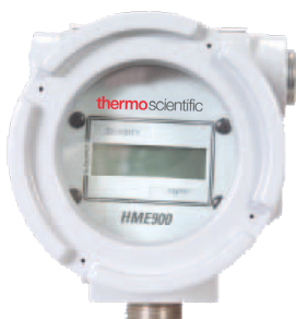
Thermo Scientific™ HME900

The HME900 head-mounted density converter option may be included