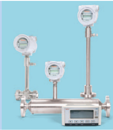
Thermo Scientific™ CM515