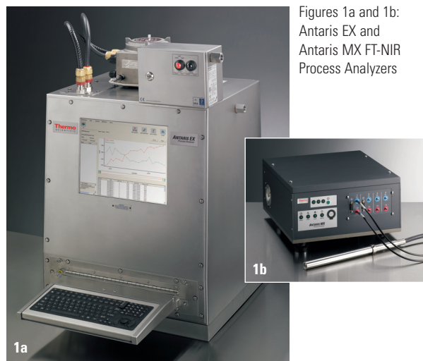
Figures 1a and 1b: Antaris EX and Antaris MX FT-NIR Process Analyzers

Data communication and storage are essential to both development- and production-scale operations but each has a different set of requirements for data handling and archival. In a production environment, data is used to make decisions for changing process conditions that, for example, optimize the yield of a product or monitor an endpoint. Data obtained by a process analyzer, however, rarely resides on the instrument that generated it. The greater use of this information is in feed forward or feed-