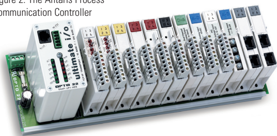
Figure 2: The Antaris Process Communication Controller

For OPC communications, RESULT software works as an OPC server upon installation, and customizable workflows within RESULT provide the specified information to the client computer. The server/client relationship can easily be set up using traditional DCOM protocols for Microsoft® Windows® communicating over a conventional Ethernet network.