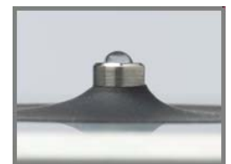
Figure 2- NanoDrop 2000/2000c