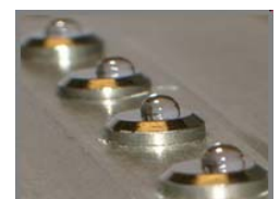
Figure 3 - NanoDrop 8000