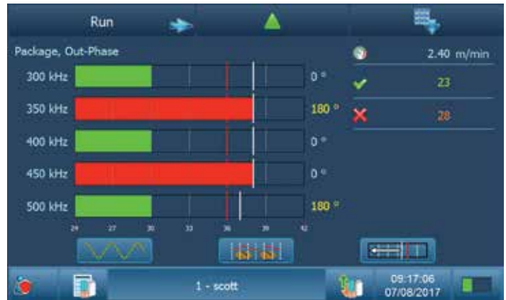
Results of each package at each Multiscan frequency are shown clearly on the Run screen

It is widely understood that ferrous is the easiest metal to detect due to its magnetic properties. Magnets attract iron. An electromagnetic field reacts most when a ferrous metal is in it, and the lower the frequency the greater the reaction. (Remember picking up nails with a magnet as a child?)