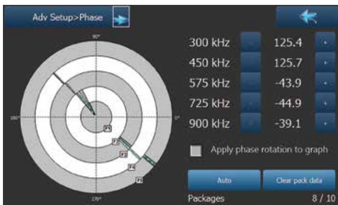
Phase learn for all five frequencies

When running, Multiscan allows you to view all the selected frequencies in real time and pull up a report of the last 20 rejects to see what caused them. If any of these rejects was false you can quickly jump to the controls that need adjustment.