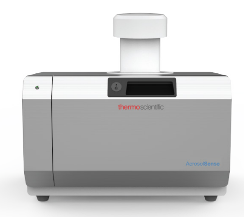
Figure 2 AerosolSense Sampler

AerosolSense Sampler exceeded the expectations of the UMASS Field Hospital Director. It demonstrated that existing infection control measures were working, helped verify that cold zones did not have the presence of SARS-CoV-2 (therefore mitigating operational impacts) and gave the entire staff confidence in their safety protocols.