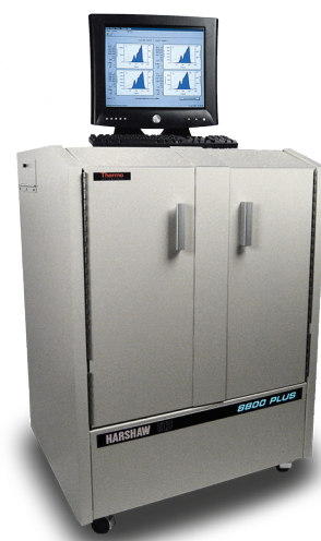
Harshaw 8800 Plus TLD Reader