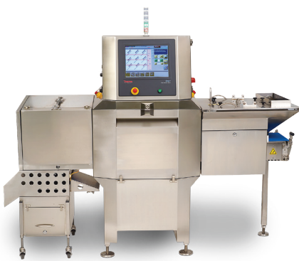
The Thermo Scientific™ Xpert Bulk X-ray System

Integrating X-ray inspection into the production process promotes food safety and quality and decreases the amount of scrap and rework. And while X-ray systems represent the best bang for the buck of all inspection devices, they are best used in combination with other inspection techniques. No one approach is perfect. An experienced and knowledgeable application specialist can help in determining how to make the best use of bulk flow X-ray.