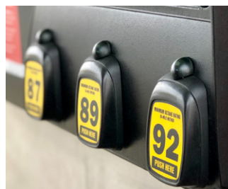
Certifying gasoline blends