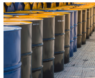
Naphtha pretreats analysis