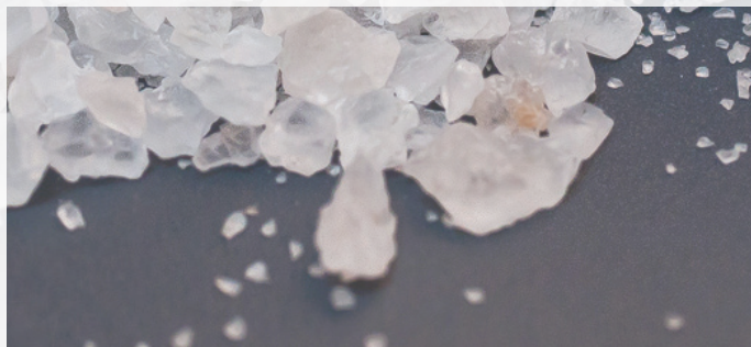
Synthetic cathinones are often intentionally mislabeled and include “not for human consumption” to avoid prosecution.

As quickly as countries make a certain drug type or derivative illegal, modified substances make their way into the market to circumvent the new laws. With drug targets evolving so rapidly, law enforcement agencies must keep pace by deploying the latest field- and laboratory-testing methods.