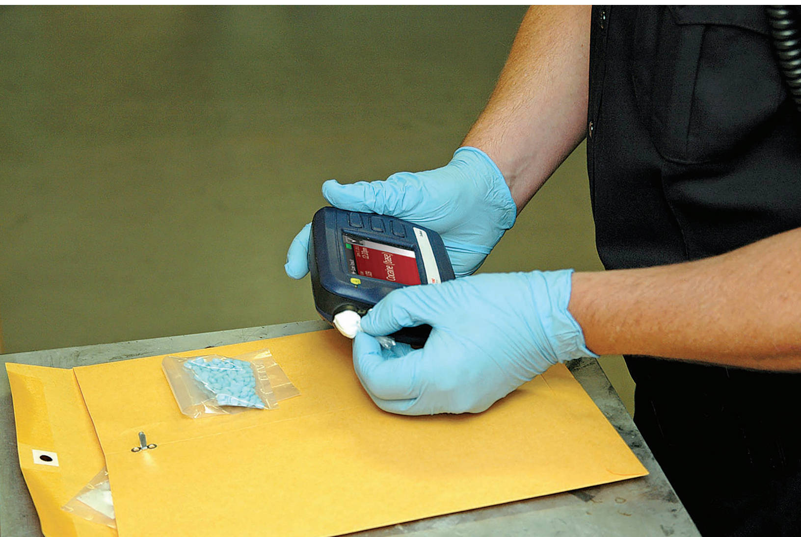
Figure 1. The TruNarc analyzer scans through sealed packaging to minimize exposure and reduce contamination risk.

Sample cathinones and their unique spectral fingerprints are plotted in Figure 3. The TruNarc™ library includes many different synthetic cathinones, enabling the rapid screening of these narcotic threats.