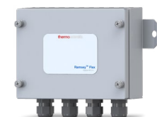
Quad Digitizer for four load cell/multiple load cell input