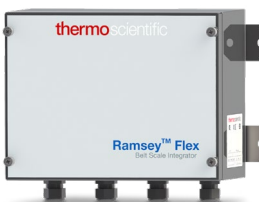
Blind without HMI for a cost-efficient set-up for remote access or harsh environments

Ramsey Flex integrators come standard with a web-based interface allowing you to monitor and manage your belt scale system from your network PC.