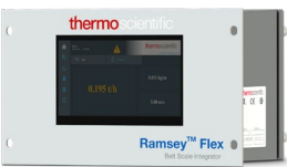
Panel mount with touchscreen HMI for centralized operation from a control room