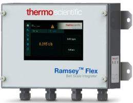
Field mount with touchscreen HMI for at-line interaction