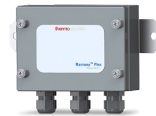
Single Digitizer for one load cell/load cell pair input

Ramsey Flex digitizers take the output signal from the weighbridge load cells and speed sensor to the electronic integrator, providing a more robust and reliable signal than standard junction boxes.