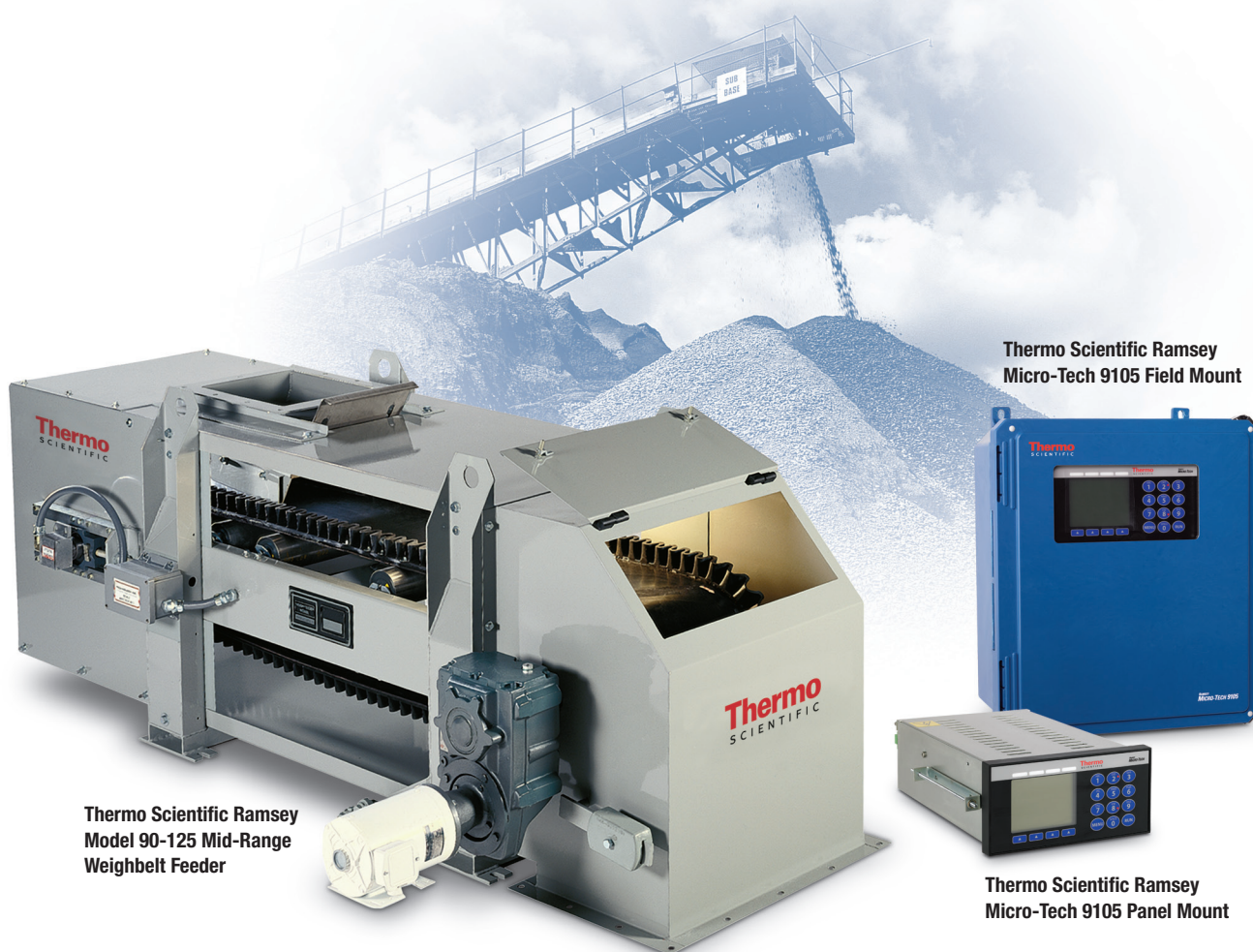
Thermo Scientific Ramsey Model 90-125 Mid-Range Weighbelt Feeder