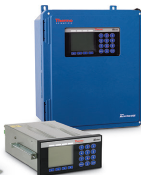
Thermo Scientific Ramsey Micro-Tech 9105 Panel Mount