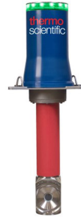
MEP-300 Multi-Element Probe

The MEP-300 Multi Element Probe is the product of 45 years of experience with probe based in-stream element analysis. It is the safest MEP ever with a retractable detector and source combining with a visual beacon to ensure no risk of radiation exposure for operators. The new detector attains higher count rates than previous generations with a better than 400% increase in copper sensitivity (CuKa). The MEP-300 has a very low background with high signal-to-noise ratio, resulting in exceptional instrument precision and perfectly matched to the industry leading sampling precision through the SamStat-C continuous sampling system.