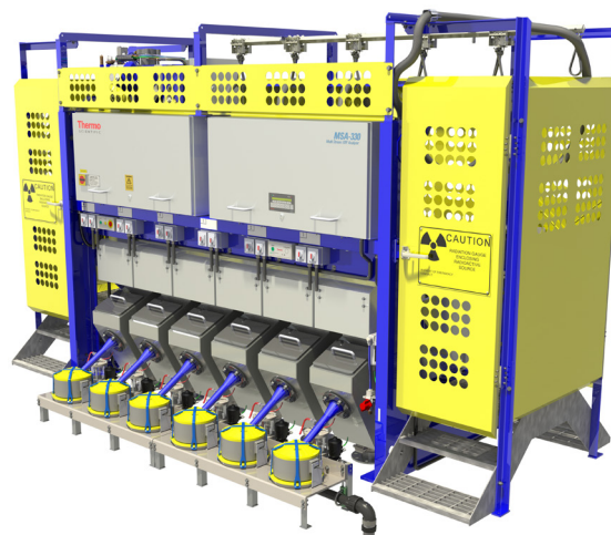
6 Stream MSA-330 Multi-Stream Analyzer with Vacuum Filter Option

The MSA-330 Multi-Stream Analyzer offers the most flexible multi stream elemental analysis solution for process control and monitoring for mineral beneficiation circuits, and can be combined with the Thermo Scientific™ AnStat-330 Online Sampling and Elemental Analysis Station to optimise the elemental analysis solution within any existing or new plant.