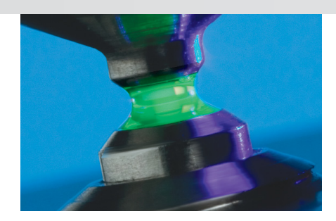
NanoDrop 3300 patented retention system

As the industry leader in micro-sample quantitation, Thermo Scientific NanoDrop products meet the needs of today's laboratory scientist with instruments that are smart, simple and robust. We combine our extensive expertise in micro-sample analysis with an in-depth understanding of real-life applications to deliver the latest in UV-Vis and Fluorescence instrumentation.