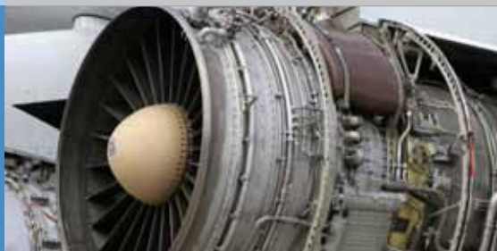
Metals reclaimed from many sources