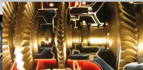
Sorting, reselling, recycling precious metals