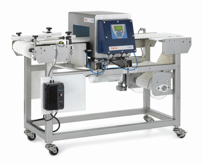
Thermo Scientific™ APEX 500 Metal Detector combined with one of many possible regional conveyor designs.

The Thermo Scientific™ APEX 500 Metal Detector delivers high sensitivity and an extensive feature set enabling you to protect your brand, comply with retailer codes of practice and meet legal requirements. With the APEX 500 metal detector in your production line, you can quickly and completely achieve your quality goals, protect expensive downstream production equipment and be assured your production shipments are free from any unwanted metallic foreign objects.