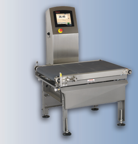
Thermo Scientific Versa Frame 44HB Heavy-duty Weigh Frame