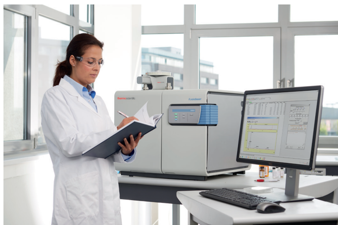
Figure 1. FlashSmart Elemental Analyzer.

The Thermo Scientific™ FlashSmart™ EA (Figure 1) copes effortlessly with a wide array of laboratory requirements such as accuracy, day by day reproducibility and high sample throughput. It operates according to the dynamic flash combustion of the sample and typically uses helium as the carrier gas.