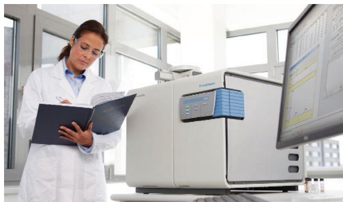
Figure 1. FlashSmart Elemental Analyzer.

Different types of carbon black samples were analyzed on the basis of the different elemental contents to demonstrate the performance of the system according to the ASTM D5373 Method and to show the repeatability obtained.