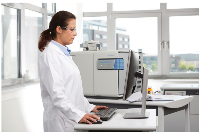
Figure 1. Thermo Scientific FlashSmart N/Protein Analyzer.

The Thermo Scientific™ FlashSmart™ Elemental Analyzer (Figure 1) requires no sample digestion or toxic chemicals, while providing important advantages in terms of time, automation and quantitative determination of nitrogen in a large range of concentrations.