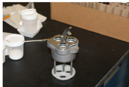
Figure 2. Dionex ASE Puck for three 60 mL collection vials.