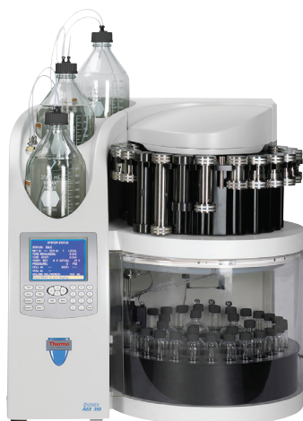
Dionex ASE 350 Accelerated Solvent Extractor system

Baking chocolate and milk chocolate bars were purchased from a local grocery store.