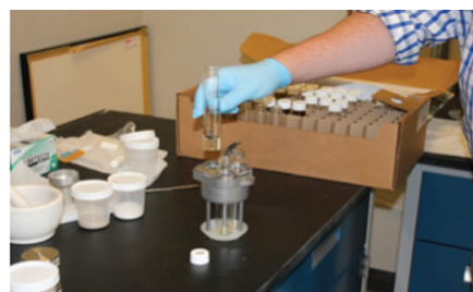
Figure 3. Extracts are loaded into the Dionex ASE Puck.