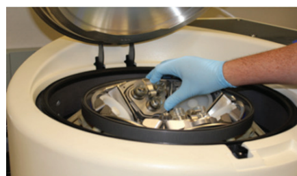
Figure 4. Dionex ASE Pucks are loaded into Rocket Evaporator.