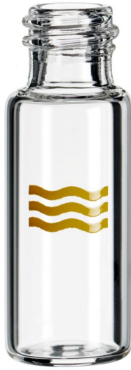
Figure 1. GOLD grade glass vial (screw thread)

AAVs were transferred in either Chromacol HPLC plastic vials or low-binding glass vials (Figure 1) and titer was assessed through SEC-FLR analysis as indicated in the experimental section.