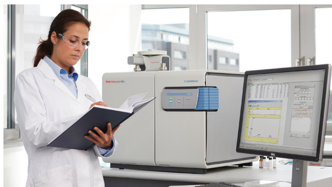
Figure 1. FlashSmart Elemental Analyzer.

A complete report is automatically generated by the Thermo Scientific™ EagerSmart™ Data Handling Software.