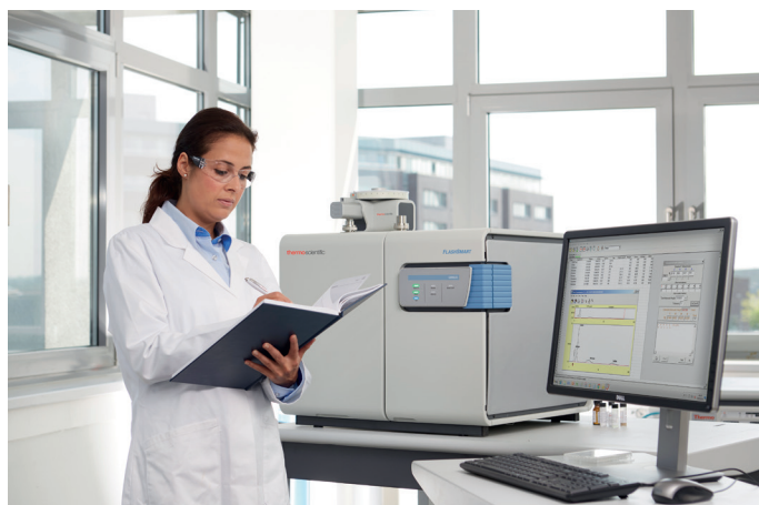
Figure 1. Thermo Scientific FlashSmart Elemental Analyzer.

In this note we assess the performance of the elemental analyzer for the N/Protein determination of spirulina algae using helium and argon as carrier gas in alternative to the Kjeldahl method and the CHNS determination.