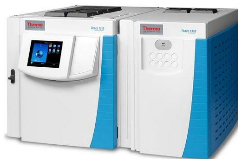
Thermo Scientific™ TRACE™ 1310 Refinery Gas Analyzers www.thermofisher.com/oil-gas-testing

Register at thermofisher.com/americasevents