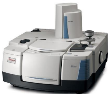
Thermo Scientific™ Nicolet™ iS50 FTIR Spectrometer www.thermofisher.com/is50ftir