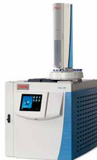
TRACE 1310 GC

In this laboratory, the average workload for GC analyses is between 500 and 700 batches per year. For this, they have many GC systems in the lab to compare with, including several Thermo Scientific systems.