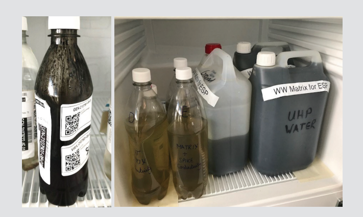
Wastewater samples for analysis.

"We needed to implement the testing in a short space of time—essentially "yesterday"—and the features on the Gallery Plus system made that possible. It quickly and efficiently carries out all the analyses and is easy to use. We report results within 24 hours 98% of the time, so it's working well."