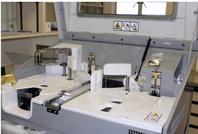
Interior view of the Gallery Plus discrete anlayzer

The instrument's basic principal of operation is as follows: A specific amount of liquid sample is automatically dispensed into a small cuvette. Between one and three method-specific reagents are then automatically dispensed into the same cuvette. After a timed incubation, the reagents will cause color to develop in the sample proportional to the analyte concentration. The color intensity of the sample is then measured at a specific wavelength by the instrument and converted to a concentration with the aid of a blank and a calibration standard. Quality control is achieved by means of an independent standard measured in the same manner. The instrument has the capability to automatically dilute and reanalyze a sample that has exceeded the measuring range. Electrical conductivity and pH is measured by a separate instrument module. The instrument is fully compatible with the prescriptions and regulations of the International Organization for Standardization ISO-17025 laboratory accreditation standard.