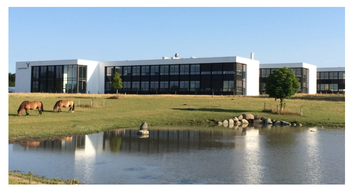
Symphogen - Copenhagen, Denmark

Thermo Fisher Scientific and Symphogen have a longstanding collaboration dating back to 2000 when Symphogen was founded. The collaboration has been built and expanded upon by a foundation of knowledge sharing. Symphogen resists any efforts to produce 'me-too' products and focus attention on developing patient focused products with unique modes of actions with the aim of moving the field forward and potentially making a huge difference to a patient's life. These ambitions can only be realised via a best in-class understanding of protein chemistry and the correct tools to go with it. It is therefore essential that Symphogen remain at the forefront of biopharmaceutical development technology. The partnership between Thermo Fisher Scientific and Symphogen provides state-of-the-art technology for drug product development as well as knowledge sharing relevant to the biopharmaceutical field.