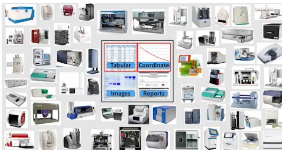
fig.2. HTB Instrument Integration is Central to Automation and Data Capture, Walker, Kenneth. Launch2017 Keynote Presentation: Amgen. YouTube, Thermo Fisher Scientific, 4 Nov. 2017, www.youtube.com/watch?v=zJLS1fG8zeg .

Once the controlled nomenclature was established, the team configured integrated workflows within the Platform for Science to provide workflow management to lab managers. At the top layer of the system, the team set up a request management system, where the scientist can define what types of experiments will occur in that request, and the Platform for Science then monitors the information and materials throughout the workflow. After the workflow is complete, the Platform for Science reports back to lab managers on the process. This provides HTB lab managers with the ability to see what is actually occurring in the lab, capture metrics to identify bottlenecks, and provides the opportunity to identify inefficiencies and implement process improvements.