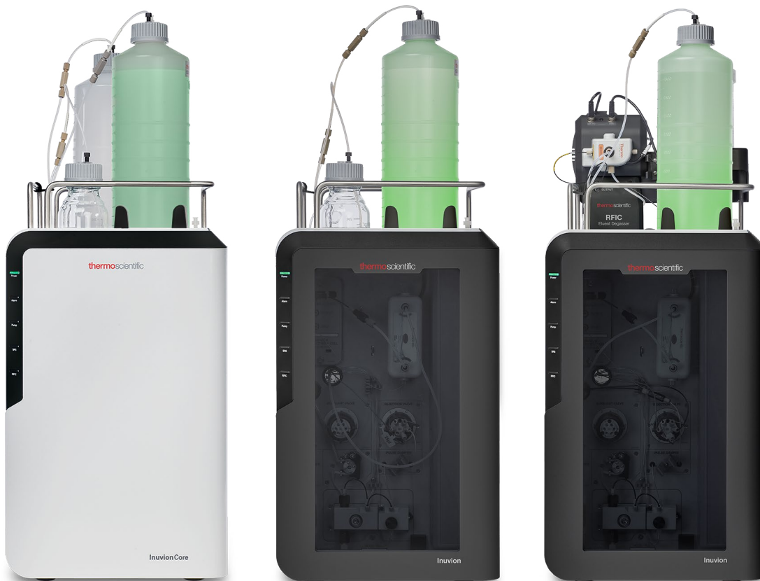
Figure 2. The Dionex Inuvion IC systems

The Thermo Scientific™ Dionex™ Inuvion™ ion chromatography system (Figure 2) is the culmination of the technological innovations and attributes described above. It is the ideal solution for laboratories that require the analysis of ionic and small polar compounds. Smart, function-driven design allows quick and safe access to everything on the instrument, and automated startup and shutdown routines ensure the system is quickly ready for the day's work without user intervention. Ultra-reliable performance is achieved with advanced high-performance pump technology and electronics that let users take advantage of a wide range of columns and chemistries to improve the speed and quality of results. It is a versatile, adaptable platform that can be precisely configured for today's needs and budget while providing confidence that it will also be able to meet future requirements. Compared to the other IC systems in the Dionex portfolio, the Dionex Inuvion IC system stands out for its functional adaptability, component accessibility, and compactness (Figure 3).