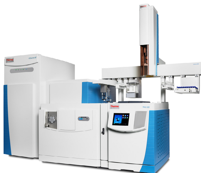
Figure 2. Q Exactive GC mass spectrometer with TriPlus RSH autosampler.