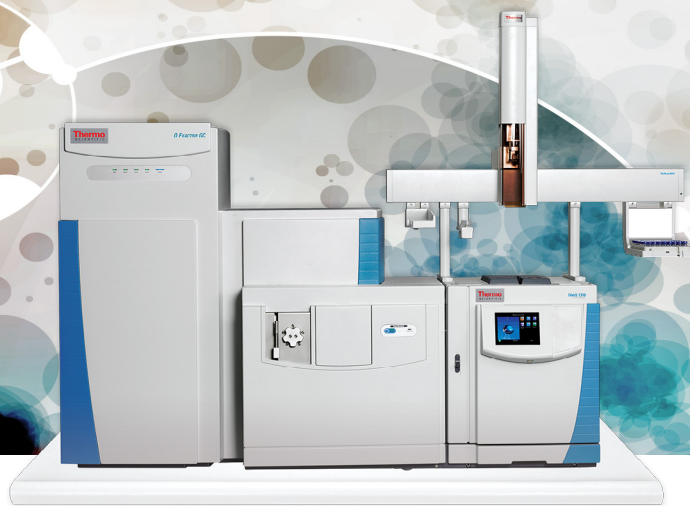
Q Exactive GC Orbitrap GC-MS/MS system