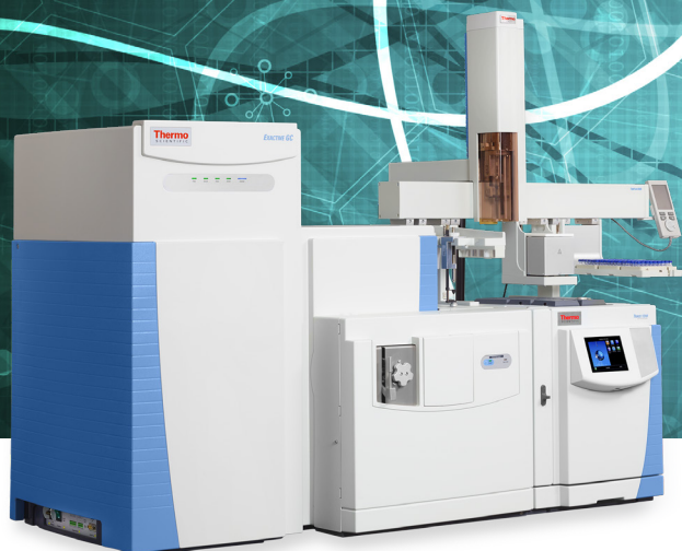
Exactive GC mass spectrometer with TriPlus RSH autosampler