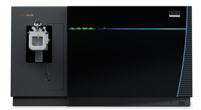
Be ready for tomorrow's most challenging demands with the Orbitrap Ascend BioPharma Tribrid mass spectrometer

With new capabilities for biotherapeutic products and native protein characterization, the Thermo Scientific<sup>™</sup> Orbitrap<sup>™</sup> Ascend BioPharma Tribrid<sup>™</sup> mass spectrometer delivers ultimate experimental throughput, versatility, and ease-of-use. Achieve greater coverage using a revolutionary hardware design that features two ion routing multipoles. Characterize intact biopharmaceuticals with improved native MS workflows. Perform sensitive and deep peptide-based analyses and improve your oligonucleotide characterization with the combination of recommended alternate fragmentation techniques that can help elucidate the most difficult-to-characterize molecules. All while producing more with less instrument setup featuring automated Auto-Ready ion source for calibration and pre-built, optimized method templates to maximize convenience and ease-of-use. Be ready for tomorrow's most challenging demands.