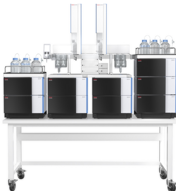
The Thermo Scientific™ Transcend™ TLX-4 UHPLC System—maximum throughput enabling four times the throughput of a single LC system with the additional benefits of Turboflow Sample Preparation Technology.