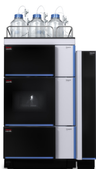
The Thermo Scientific™ Transcend™ VTLX-1 UHPLC System incorporates the benefits of Turboflow Sample Preparation Technology.

Injections are interleaved to maximize throughput and mass spectrometer utilization.