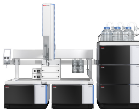
The Thermo Scientific™ Transcend™ TLX-2 UHPLC System—doubles throughput compared to a single LC system and incorporates the benefits of Turboflow Sample Preparation Technology.