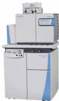
Figure 1. The Thermo Scientific EA IsoLink IRMS System.

Recently, laboratories have suffered from increasing analytical costs due to worldwide reduced availability and higher market prices of helium. In elemental analyzers, used as either standalone instruments for weight % elemental determinations or elemental analyzers coupled to isotope ratio mass spectrometers for isotope ratio determination, helium is traditionally used as a carrier gas in the analytical process and as a reference gas for the Thermal Conductivity Detector (TCD).