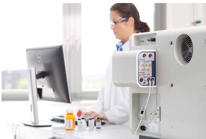
Figure 2. Thermo Scientific MultiValve Control (MVC) Module.

The FlashSmart EA performs also trace sulfur determinations, when it is coupled with the Flame Photometric Detector (FPD). This configuration combines the advantages of the elemental analyzer with the sensitivity and robustness of the FPD Detector. The FlashSmart Elemental Analyzer can be configured for CHNS determination (performed on the furnace on the left) with the TCD Detector and for trace sulfur analysis (performed on the furnace on the right) with the FPD Detector.