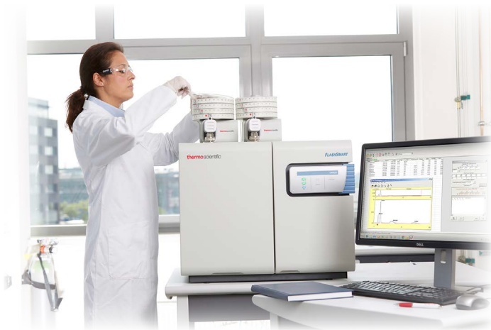
Figure 1. Thermo Scientific FlashSmart Elemental Analyzer.

Both pneumatic circuits for CHNS by TCD Detector and trace sulfur determination by FPD Detector are preset in the system. The MVC Module allows the switch from one circuit to the other. The dedicated EagerSmart Data Handling Software controls the MVC Module and does not require manual intervention on the configuration.