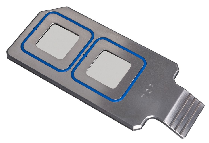
Figure 1. iCAP PRO Series ICP-OES Purged Optical Path window holder

The iCAP PRO Series ICP-OES has a Purged Optical Path (POP) that is designed to protect the fore-optics housing and mirrors. Quartz glass windows (two on a duo system and one on a radial system) are located in a fully sealed holder, which is placed between the plasma interface and the fore-optics (Figure 1). The POP windows are purged from both sides in order to prevent matrices from the samples entering the fore-optics. These windows can be easily removed and cleaned by the user as required.