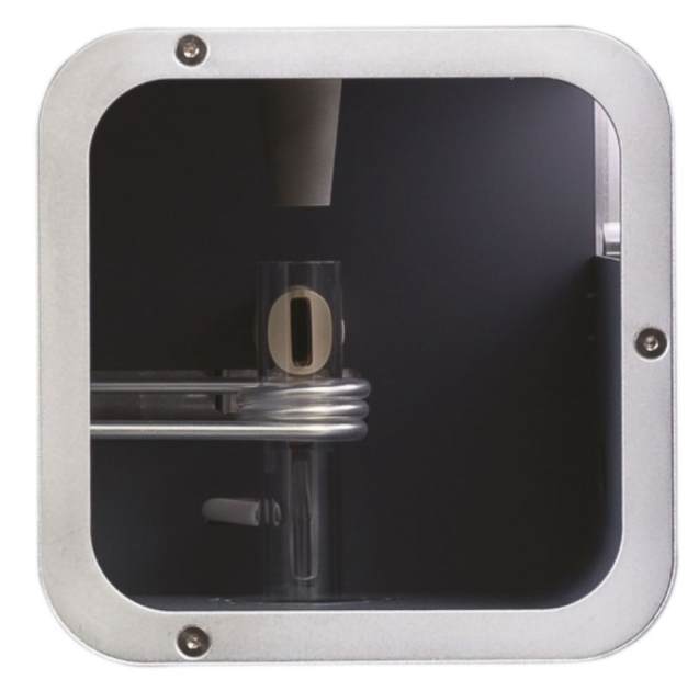
Figure 4. iCAP PRO Series ICP-OES duo torch box with inner torch box mounted

The new vertical torch design of the iCAP PRO Series ICP-OES provides excellent detection capabilities with high matrix robustness and eliminates concerns regarding interface corrosion and excessive maintenance requirements.