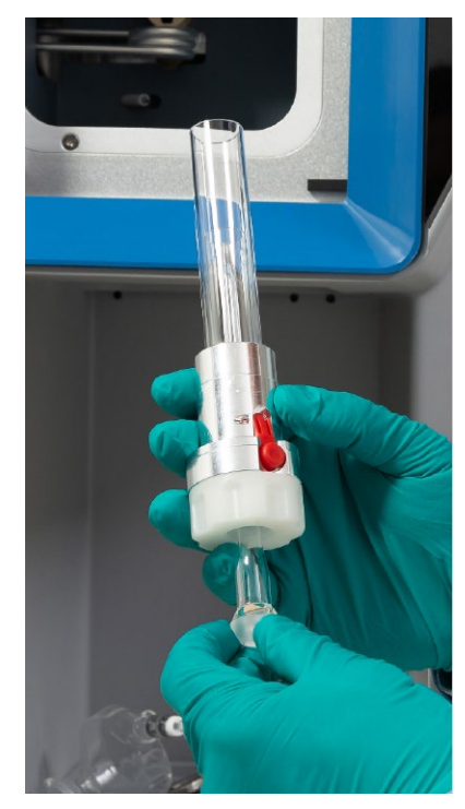
Figure 2. iCAP PRO Series ICP-OES EMT Torch

The robust Thermo Scientific ICP-OES Enhanced Matrix Tolerance (EMT) torch design has been improved for the iCAP PRO Series ICP-OES when compared to the EMT torch used with the Thermo Scientific iCAP 7000 Series ICP-OES. The mounting design of the torch holder and center tube holder allows for a more accurate and easy installation to ensure optimal performance and to avoid air leaks. The center tube holder is made of highly robust polyphenylsulfone (PPSU) material and has heat resistant O-rings installed to enable an airtight sealing (Figure 2).