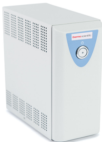
247 Instrument Controller

* Does not require upgrades to the operating system or for virus protection