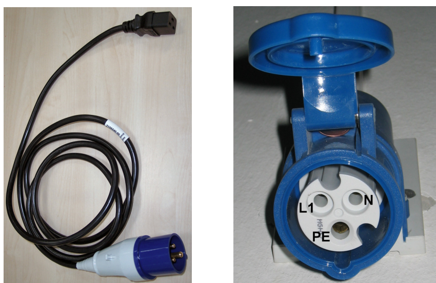
Figure 4-1. Power cable and wall receptacle

The Q Exactive GC GC-MS system requires two power cables and wall receptacles: one for the mass spectrometer and one for the TRACE 1310 GC. Two receptacles (P/N 2105500) are provided by Thermo Fisher Scientific as part of the Preinstallation Kit. Two power cables (P/N 2112490) are provided by Thermo Fisher Scientific as part of the Installation Kit.