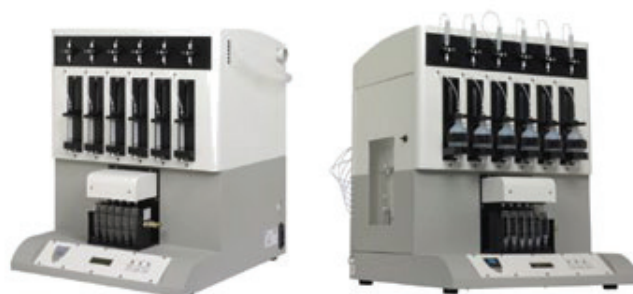
FIGURE 1. Dionex AutoTrace 280 SPE instrument cartridge system (left) and disk system (right).