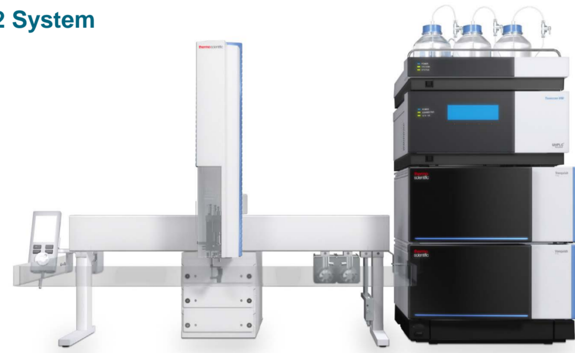
Figure 1. Thermo Scientific Transcend LX-2 System

LC separation was achieved on a Thermo Scientific™ Hypersil GOLD™ analytical column 50 × 2.1 mm (1.9 µm) kept at 40 ° C. Injection volume was 20 µL.