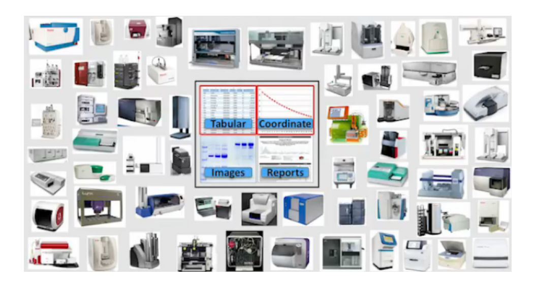
fig.2. HTB Instrument Integration is Central to Automation and Data Capture, Walker, Kenneth. Launch2017 Keynote Presentation: Amgen. YouTube, Thermo Fisher Scientific, 4 Nov. 2017, www.youtube.com/watch?v=zJLS1fG8zeg.

Once the controlled nomenclature was established, the team configured integrated workflows within Platform for Science software to provide workflow management to lab managers. At the top layer of the system, the team set up a request management system, where the scientist can define what types of experiments will occur in that request, and Platform for Science software then monitors the information and materials throughout the workflow. After the workflow is complete, Platform for Science software reports back to lab managers on the process. This provides HTB lab managers with the ability to see what is actually occurring in the lab, capture metrics to identify bottlenecks, and provides the opportunity to identify inefficiencies and implement process improvements.